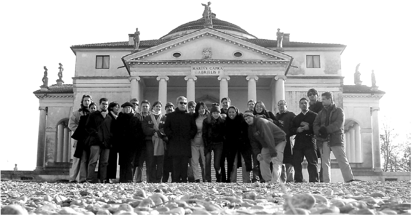
University of Miami Palladio Journey, 2001