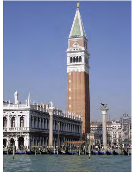
Campanile San Marco, Venezia

In winter time, the city of Venice and its region of influence, the Veneto, are most beautiful and evocative as the mist from the Adriatic Sea moves across the “lagoon” and the marshes of this extraordinary geography. The architecture of Andrea Palladio, in the city and the territory, is impacted by this muted northern winter light and the luminous clarity of the Italian Renaissance. This program consists of a visit to the city of Venice and to the work of Andrea Palladio. The artistic and cultural heritage of Venice and its territory, evident along its canals and squares, in museums and churches, expose a dazzling culture, which spans a thousand years. In Palladio’s architecture this extraordinary legacy is manifest in the theory behind the works and the buildings themselves. The houses, palaces and churches Palladio built in the 16 th century are works of lasting values and exceptional lessons in architecture and urbanism. The program visits specific works of Palladio in Venice, Vicenza and the countryside as well as works by artists and architects within the cultural sphere which affected Palladio’s work, such as the painting schools of Venice and the frescoes of Giotto in the Scrovegni Chapel in Padova; and in Mantova, the influential work of Leon Battista Alberti, Andrea Mantegna and Giulio Romano.