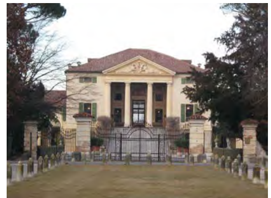
Villa Emo, Fanzolo di Veduggio