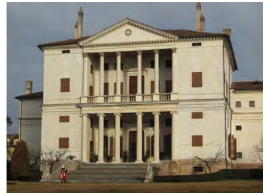
Villa Cornaro-Rush, Piombino Dese