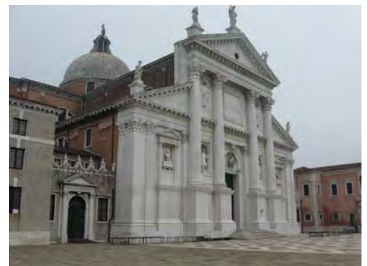
San Giorgio Maggiore, Venezia